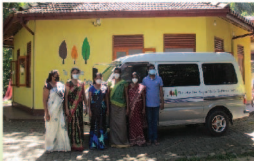
The Project for Improving Facilities of Center for Disabled Children in Buttala, Monaragala (Surangani) 2020