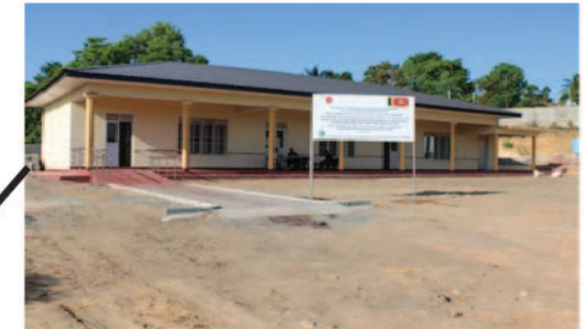
The Project for Building for Children with Disabilities at Al Arsath School in Ampara District (OHRD) 2019