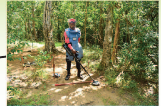
The Project for Demining in Kilinochchi and Mullaitivu Districts in Northern Sri Lanka in Assistance of Peace Building, Rehabilitation and Reconciliation Process (DASH) 2022.