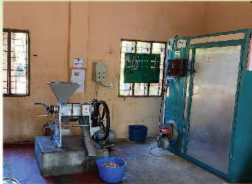
The Project for Installation of Coconut Oil Production Facilities in Mullaitivu District (Tech Ceylon) 2020