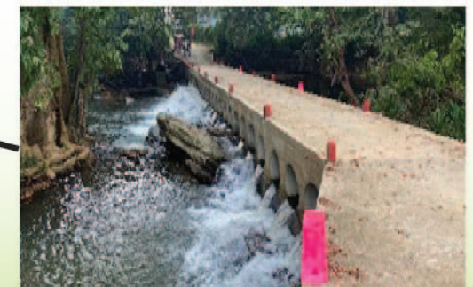
The Project for Constructing a Causeway in Buttala, Monaragala District (Dimuthu Community Development Society) 2019